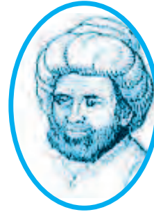
Muhammad ibn Musa al-Khwarizmi (C.E. 780 – 850)

A lemma is a proven statement used for proving another statement.